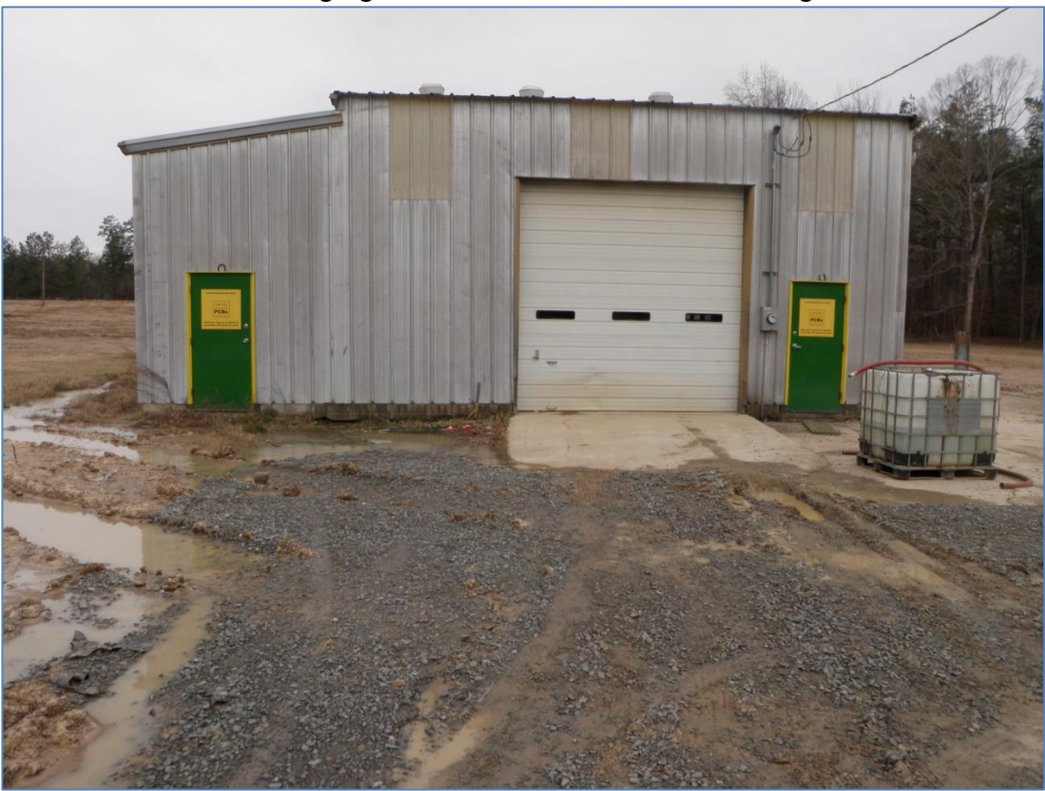
Warning Signs Placed on the Warehouse Building