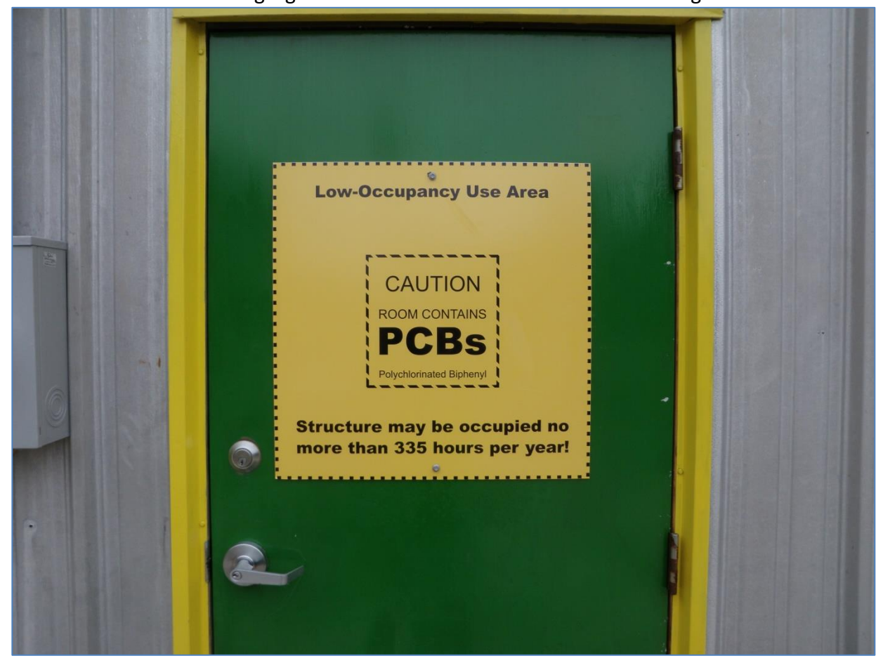
Warning Sign Placed on Entrance to Warehouse Building